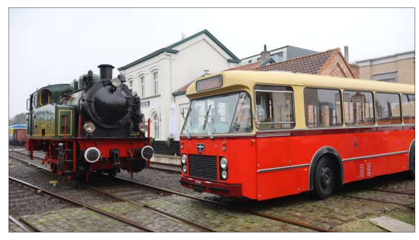
"Tom" together with a Van Hool bus