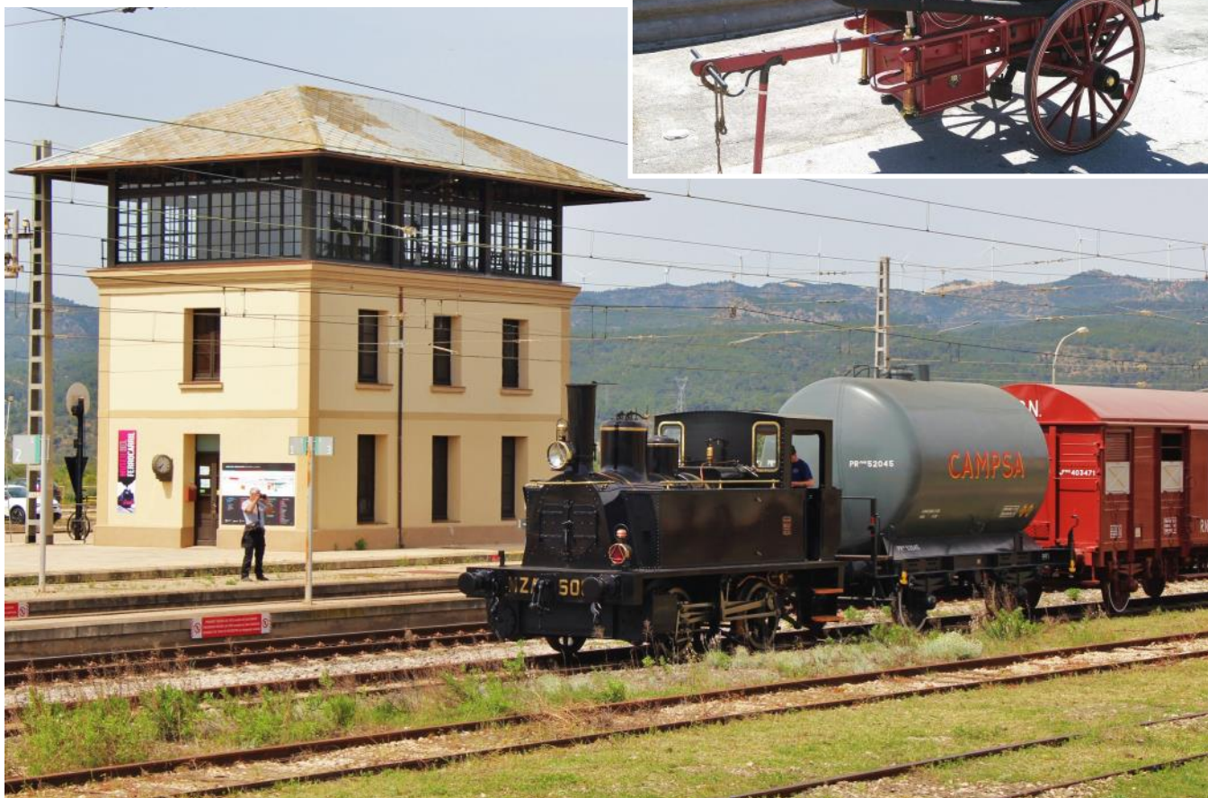
Steam festival in Móra la Nova - above : "Bombers" demonstrate fire-fighting techniques - underneath : - "Cuco" - a real star of the weekend.