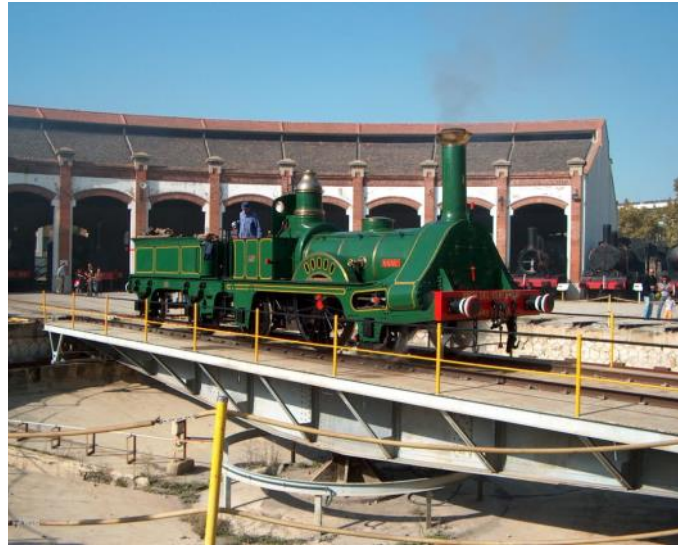
Replica of the "Mataró" on the turntable.

The Fire Department will demonstrate how to put out a fire with this cutting-edge technology of its time. The event has the collaboration of the Móra la Nova Town Hall, the