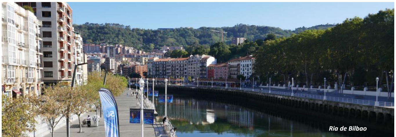
Ria de Bilbao