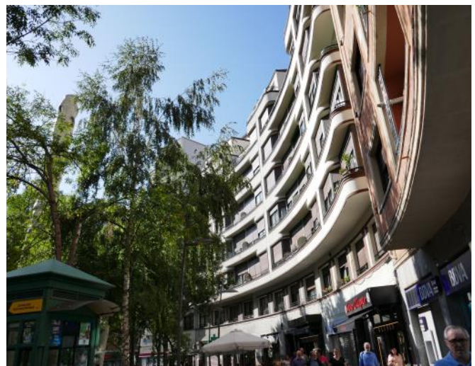
Bilbao 2019.

More information coming soon www.fedecrail.org