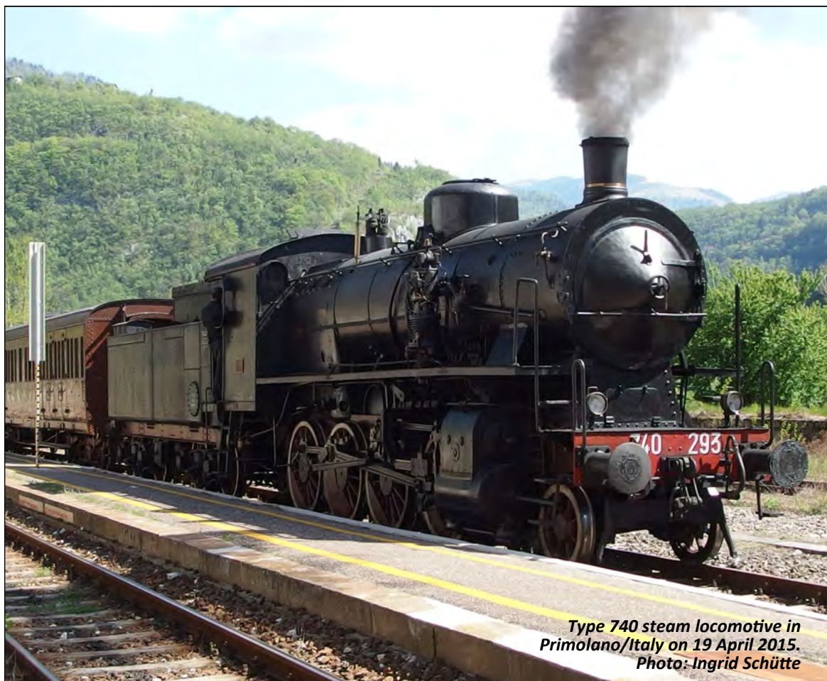
Type 740 steam locomotive in Primolano/Italy on 19 April 2015.