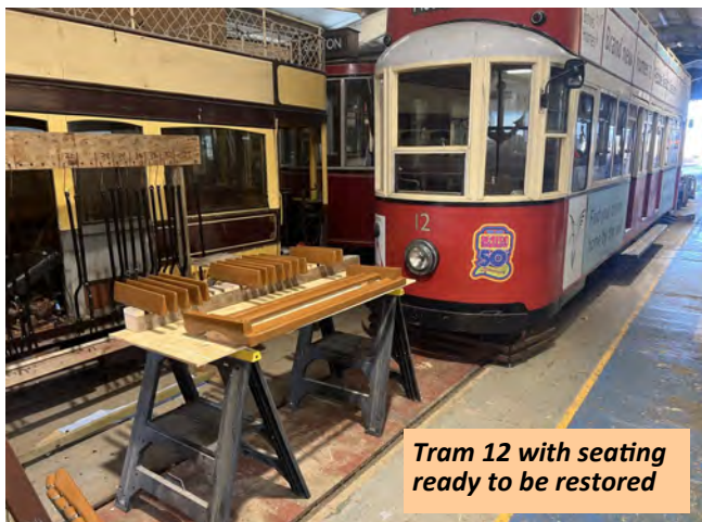
Tram 12 with seating ready to be restored