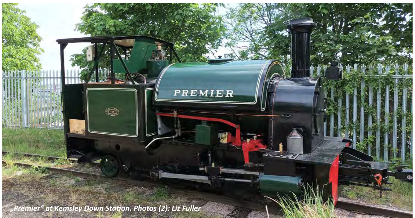
„Premier“ at Kemsley Down Station.

In 1994 ‘Premier’ who had done sterling work for the railway since handover in 1969 was withdrawn