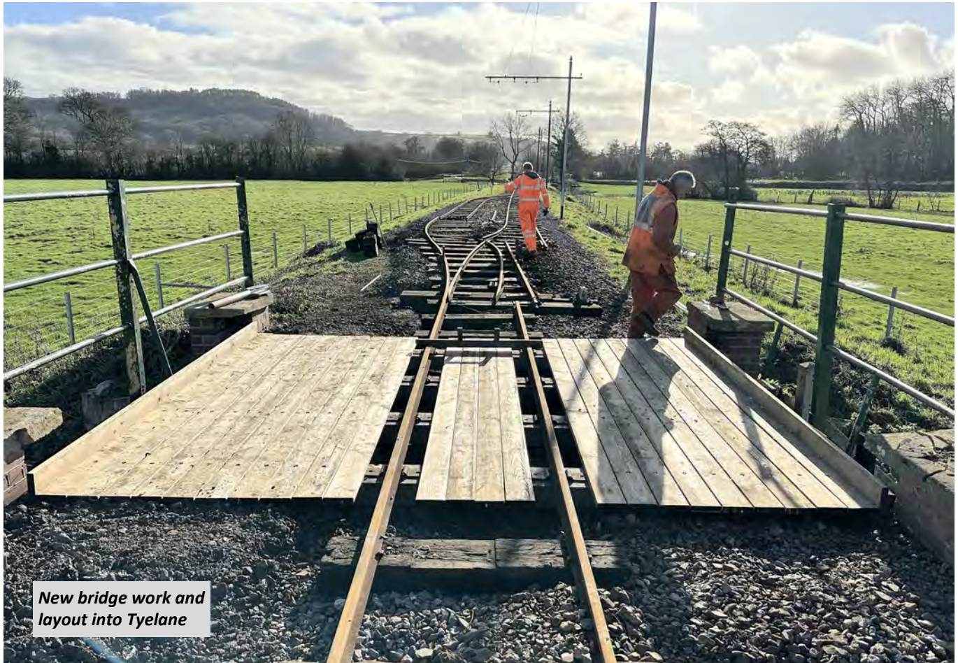
New bridge work and layout into Tye Lane